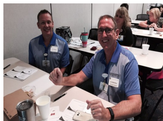
Staff from Johnston Health enjoy the session.