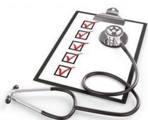
Joint Commission Survey- Collaborating with Your Peers

Twenty-four attendees from seven hospitals participated in this conference call to receive joint commission updates from Sampson Regional and Onslow Memorial Hospital. Highlights from their JC Survey included issues on Life Safety, Infection Control, Home Health, Emergency