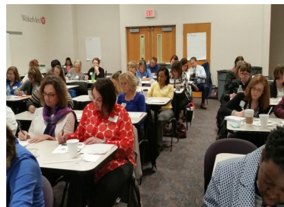
Neuroscience Of Leadership