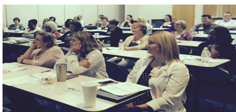
Managing Difficult Employees